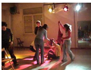
Visual poem: "The loss"