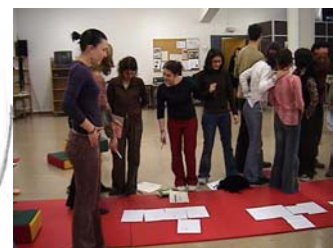
c) oral description